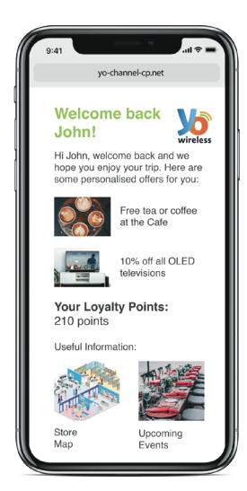
Yo Wireless WiFi Login Page Examples for new vs. returning visitors